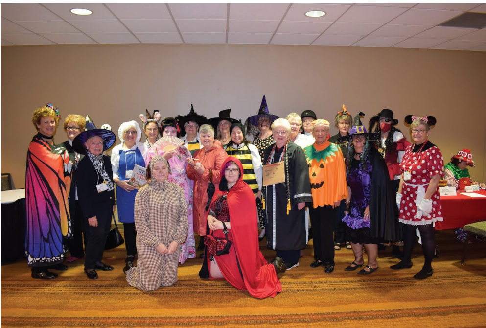
Maryland Clubwomen celebrating Halloween at SER.