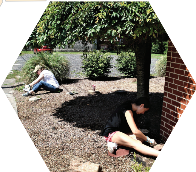
Cumberland Juniors hosted a community garden clean-up project.

Please enjoy these photos submitted by the Western District clubs.