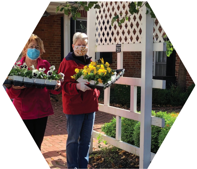
Frederick Woman's Civic Club hosted a flower sale fundraiser.