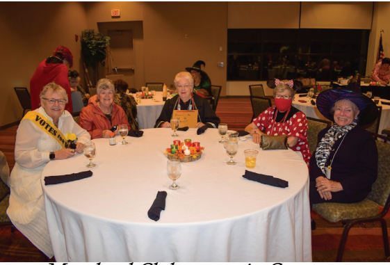
Maryland Clubwomen in Costume.