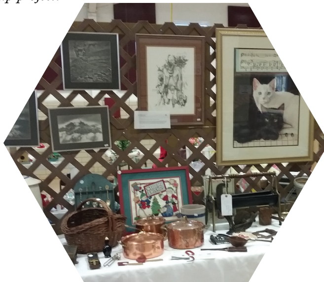
Civic Club of Oakland hosted an antique show for their community.