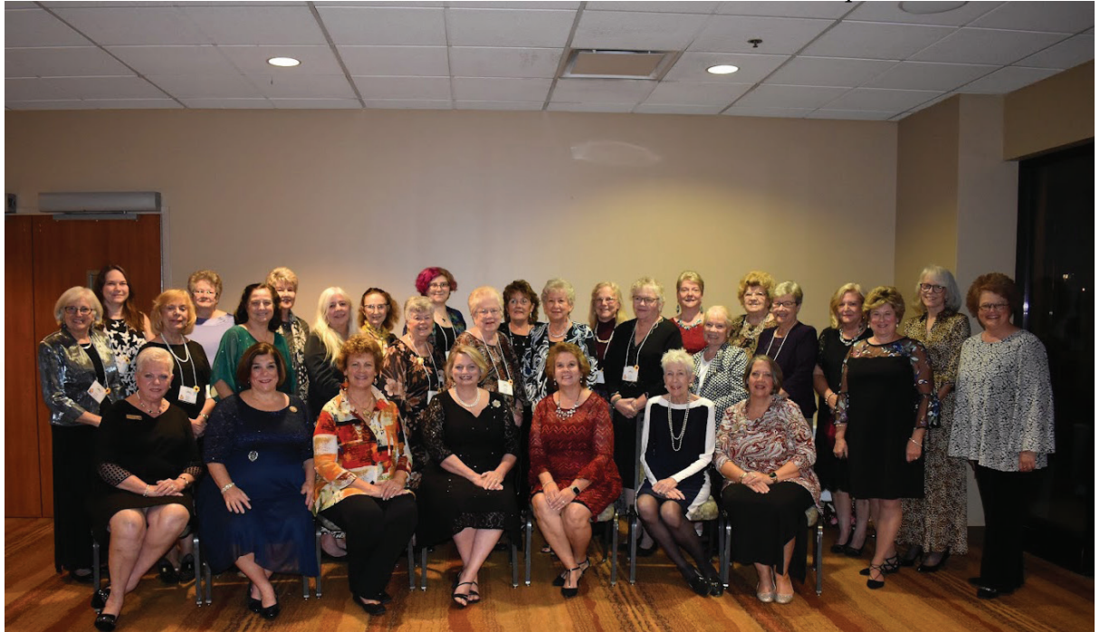
Maryland Clubwomen on State Night.